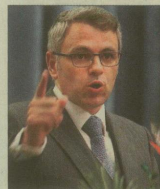
■ J&K Chief Minister Omar Abdullah

“You should avail this opportunity as it is only for Jammu and Kashmir and no other state in the country has this programme,” he said, impressing upon the students to explore possibilities of attaining gainful employment through these schemes after completion of studies.